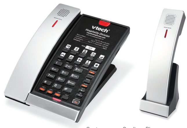
Contemporary Cordless Phone, Handset and Charger

Pulse Supply sales@pulsesupply.com www.pulsesupply.com/vtech TEL:+1-410-583-1701 FAX:+1-410-583-1704