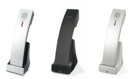
Contemporary Handset and Charger*