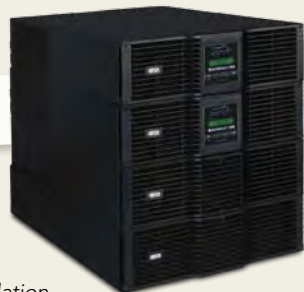
SmartPro® Line-Interactive UPS Systems provide automatic voltage regulation.

Protect valuable data from loss or corruption. Keep vital communications operational. Prevent downtime and lost productivity. Support continuous operation during generator startup.