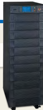
SmartOnline 3-Phase UPS Systems provide high-capacity centralized power.