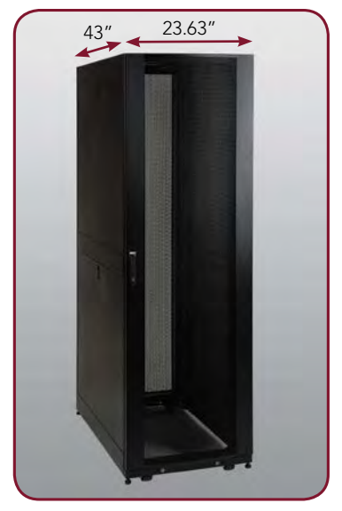
Standard Rack Enclosure

Colocation enclosures are divided into secure upper and lower compartments, each with separate, lockable doors and side panels. Divided compartments allow you to maintain the physical security of installed equipment for multiple tenants within a single enclosure footprint. They can also be used to subdivide equipment by security level or department.