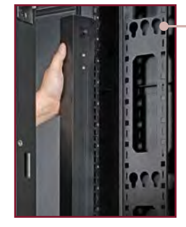
Toolless Mounting Slots

SmartRack enclosures have been designed from the perspective of the installer, and that philosophy shows in the little details that make small tasks quicker and easier, adding up to big benefits over the workday. Enclosures arrive ready for rapid deployment and roll into place on sturdy casters. Features