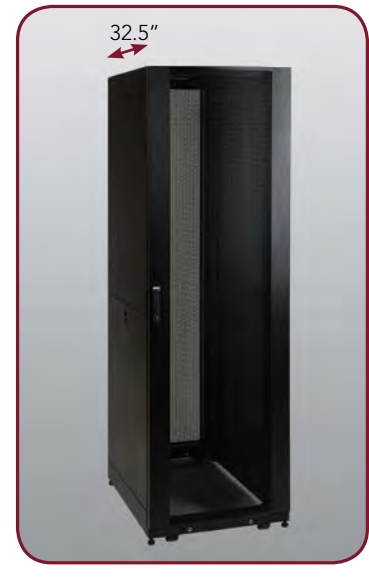
Shallow-Depth Rack Enclosure