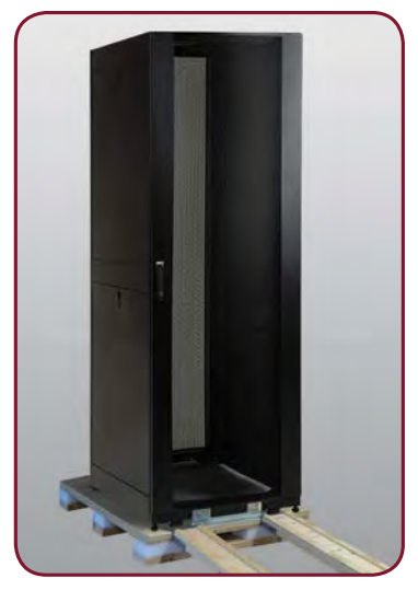
Shock Pallet Rack Enclosure