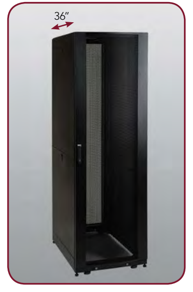
Mid-Depth Rack Enclosure