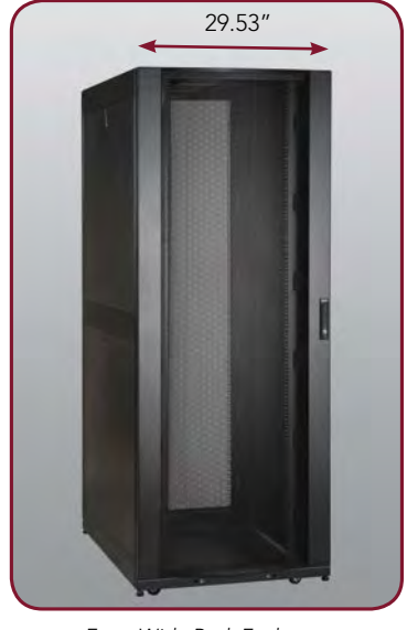
Extra-Wide Rack Enclosure