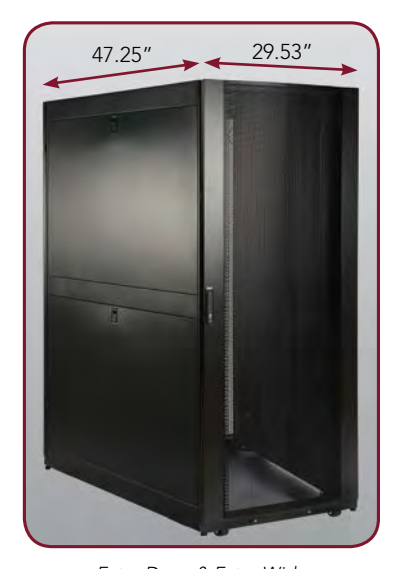
Extra-Deep & Extra-Wide Rack Enclosure