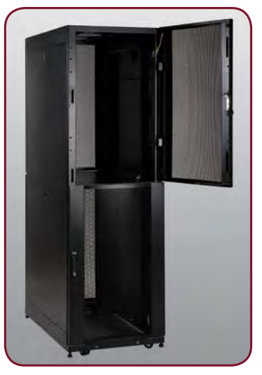
Colocation Rack Enclosure