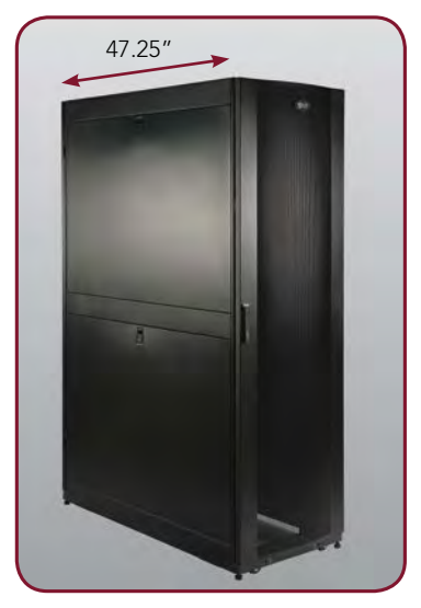
Extra-Deep Rack Enclosure