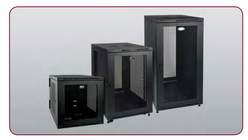
Compact Rack Enclosures

Both NEMA-rated and seismic-certified enclosures offer heavy-duty, torsion-resistant construction that helps withstand movement and vibrations in harsh working environments. Seismic-certified enclosures are also tested to meet stringent requirements for use in the strongest earthquake zones.