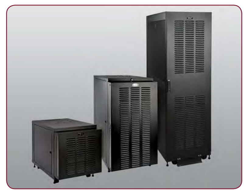
NEMA-Rated Rack Enclosures