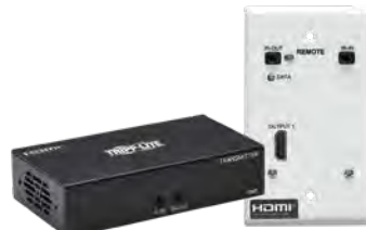
HDMI to HDMI