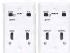
HDMI to 2 x HDMI B127A-2A1-FHFH Dual-Output Extender/Splitter Kit