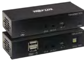
USB-C to HDMI