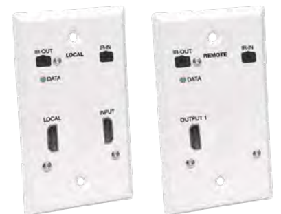
B127A-1A1-FHH Extender Kit