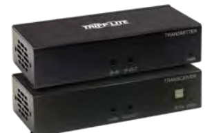
HDMI to HDMI