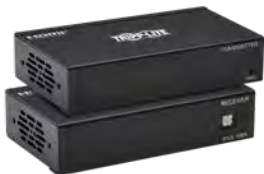
HDMI to 2 x HDMI B127A-2A1-BHBH Dual-Output Extender/Splitter Kit