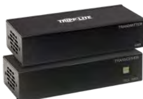
DisplayPort to DisplayPort