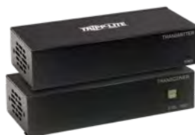
DisplayPort to HDMI