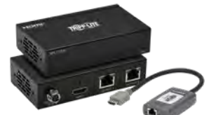
HDMI to 2 x HDMI B127A-002-BHPH2 2-Port Extender/Splitter Kit*