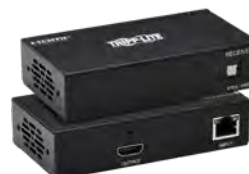
HDMI B127A-1A0-BH Add-on Receiver*