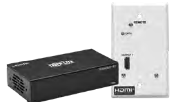
DisplayPort to HDMI