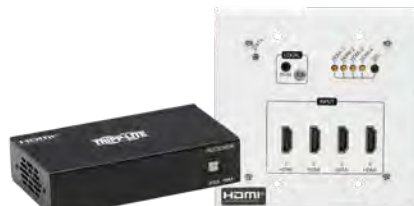
4 x HDMI to HDMI