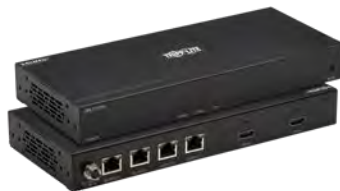
HDMI B127A-004-BH 4-Port Extender/Splitter*