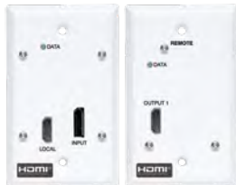
DisplayPort to HDMI