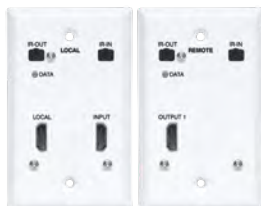
HDMI to HDMI