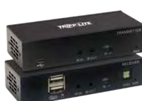
HDMI to HDMI