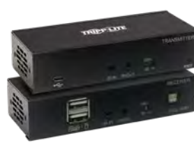
DisplayPort to HDMI