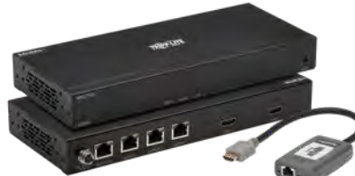
HDMI to 3 or 4 x HDMI B127A-004-BHPH3 4-Port Extender/Splitter Kit*