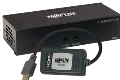
B127A-1A1-BHPH Extender Kit