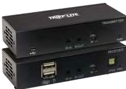
B127A-1A1-BCBH Extender Kit