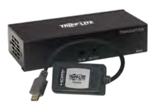
HDMI to HDMI