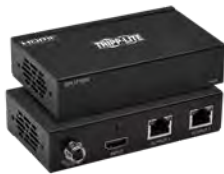
HDMI B127A-002-BH 2-Port Extender/Splitter*