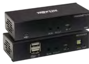
DisplayPort to DisplayPort