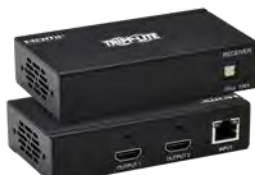
2 x HDMI B127A-2A0-BH Add-on Receiver (Dual Output)