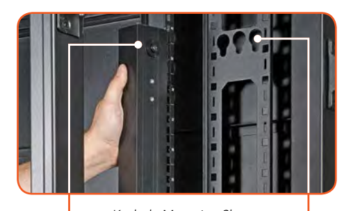
Keyhole Mounting Slot Toolless Mounting Button

Detachable buttons permit quick installation of vertical PDUs in keyhole mounting slots of compatible racks.