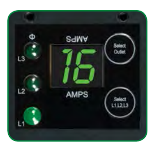
Multimode Load Meter