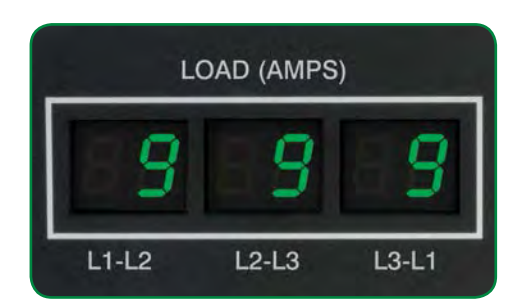
Triple Load Meters