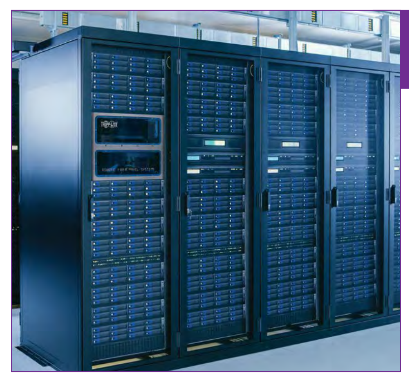
The 7U NRFP204MM-MINI integrates into smaller fiber networks than the larger 10U models do.