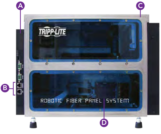
Model: NRFP204MM-MINI (Front)