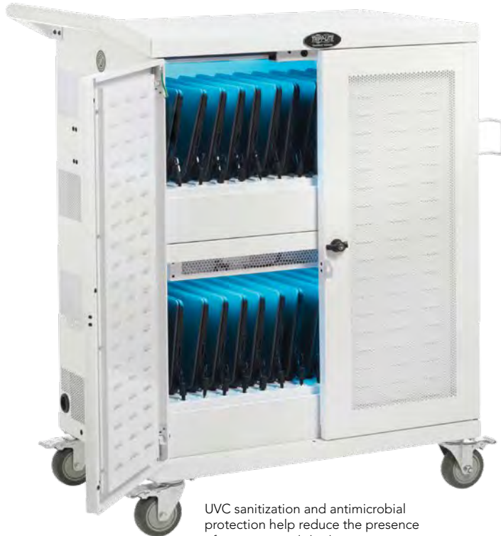
UVC sanitization and antimicrobial protection help reduce the presence of germs on mobile devices.