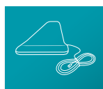
N-Range outside antenna

» See page 2 for specifications and installation example