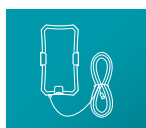
Dash-mount cradle antenna