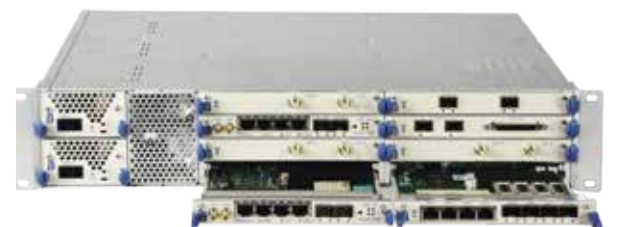
AGS20L 2RU - 8 modular slots

AGS20L aggregates traffic incoming from multiple IF based ODU and Ethernet based full outdoors, all feeding into a single node. Its modular design offers full redundancy (no Single Point Of Failure) regardless of the radio configuration, improving resiliency of aggregation and backbone sites.