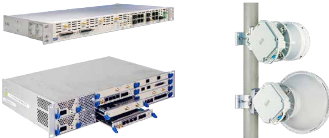
AGS20 SERIES IDUs and ODUs

COMPANY WITH QUALITY SYSTEM CERTIFIED BY DNV GL = ISO 9001:2015 =