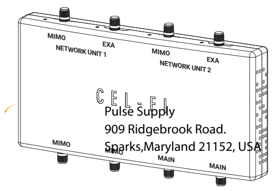
Small Cell Interface (SCIF)