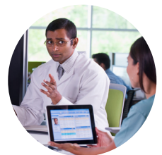
Primary or Redundant Connectivity