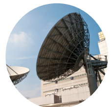
Leased Line Replacement