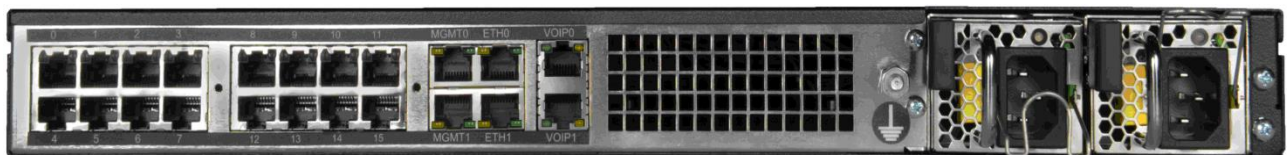
Tmedia TMG800 1U VoIP gateway, rear view (dual AC power input shown)

CCPS = Completed Call per Second CAPS = Call Attempts Per Second Contact us for other protocol combinations