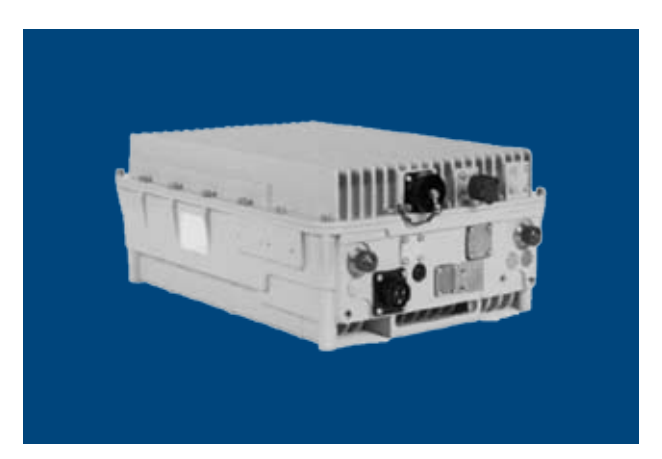
8200: Mobile WiMAX ODU with integrated 2TX and 2RX

ASN specifications of Mobile WiMAX define the interoperability among end-user devices, Base Stations and the CSN infrastructure including authentication, control of user services and mobility management. The 6000 Series integrates seamlessly with the EION industry award-winning Wireless Services Gateway (WSG) for full featured service provider networks and the lightweight ASN Express and EION AAA Express for entreprise applications.