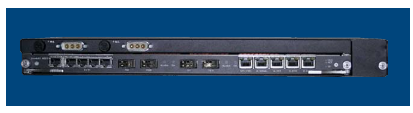
StarMAX 6100 Base Station

The 8200 ODU unit serves as the high TX power radio for each sector. Each 8200 has two transceivers in the same housing to support 2x2 MIMO with a single ODU unit. For maximum radio performance two separate cables are used: one optical for IDU/ODU interconnection and one copper power supply cable for powering the ODU. Using an optical cable for IDU/ODU interconnection eliminates all of the attenuation, signal loss and performance reduction that happens with systems using coax connections. Both cables have weather-proof connectors.