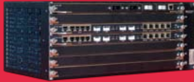
StarMAX 6400 Base Station

EION Wireless' StarMAX 6000 Series WiMAX base station encompasses the flexibility and performance needed for a future proof 16e base station product. By delivering highly competitive and innovative mobile broadband triple-play services, it reduces your cost and increases your revenues for a faster ROI.