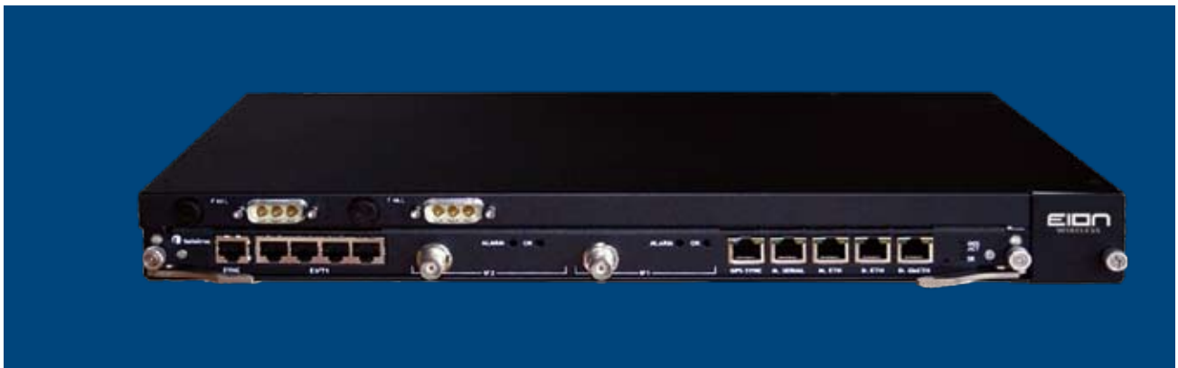
StarMAX 6100 Base Station

To enable maximum coverage and maximum data throughput, many channel bandwidths, modulations and frame lengths are implemented. TDD duplexing is used for optimal RF spectrum usage and better support of asymmetrical-type of traffic. The SNMP-based Network Management System and Central Provisioning System offers full control over network performance, offering central, remote maintenance and provisioning.