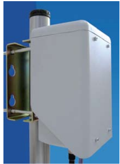
StarMAX 8100 ODU Unit

The StarMAX 6400 can also be configured to support IEEE 802.16e-2005 Mobile WiMAX. In this case, the WiMAX blade is configured with PMP-E modules. A single blade supports 2 sectors with MIMO 2x2 diversity.