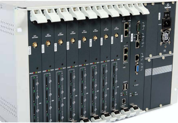
On-site Messaging API-based Unit

Enable sending and receiving of single and bulk SMS messages