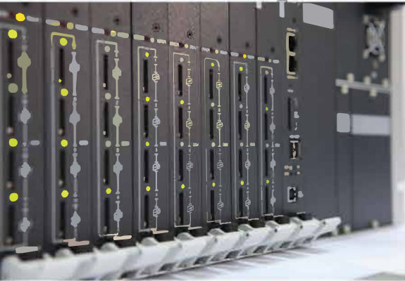
HG-4000/6U VoIP-GSM Gateway

Heavy-duty, multi-channel, cost-efficient gateway connects your VoIP and GSM networks