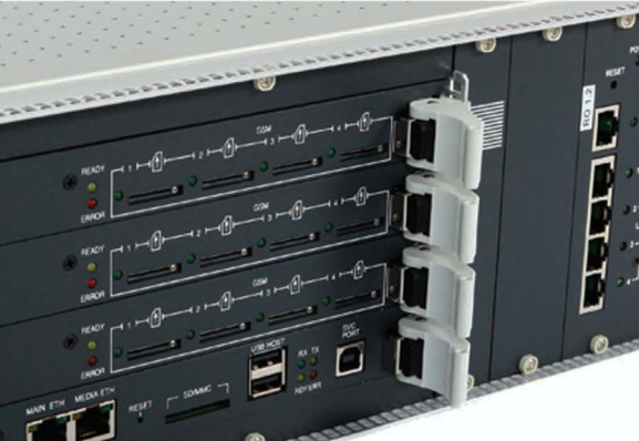
HG-4000/3U VoIP-GSM Gateway

Connect between your VoIP and GSM networks and reduce your operating costs