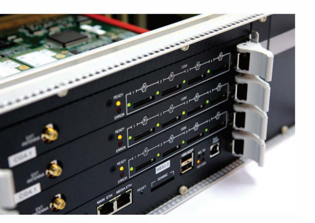
HG-3000/3U PRI-GSM Gateway