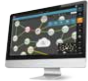
RADview Management and Domain Orchestration