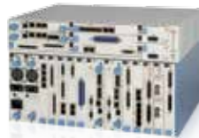
Megaplex-4 Next-Generation Multiservice Networking Node