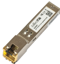
RJ45 SFP copper module