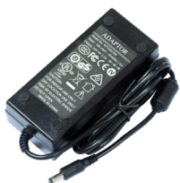
24V 2.5A Power adapter

909 Ridgebrook Road., Sparks, Maryland 21152, USA TEL : +1-410-583-1701 FAX : +1-410-583-1704 E-mail: sales@pulsesupply.com https://www.pulsesupply.com/mikrotik-products