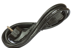
2x IEC cords