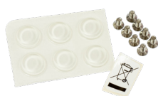
Screw and feet kit